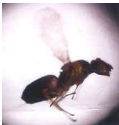
Figure 1. Quadrastichus erythrinae – female wasp.

Sustainable control of the pest can probably be achieved by classical biological control using natural enemies from the homeland of the gall wasp. But the origin and distribution of the wasp is yet to be determined. A few parasitic wasps belonging to Encyrtidae, Eupelmidae and Pteromalidae were reared from galled Erythrina twigs in Taiwan 7 . Pruning of infected branches results in trees putting forth fresh growth which again get affected by the pest, further debilitating the trees. Pruning and burning of the affected shoots in an entire locality on a community basis may yield result. Application of systemic pesticides may be tried as a short-term emergency measure. In Hawaii though pruning failed to contain the damage, bark injection of the systemic pesticide imidacloprid had some effect in protecting new growth 10 . Spread of the pest to hill tracts of south India where