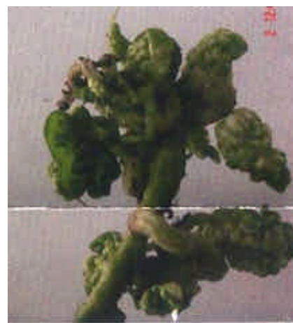
Figure 3. Symptoms of gall wasp infestation.